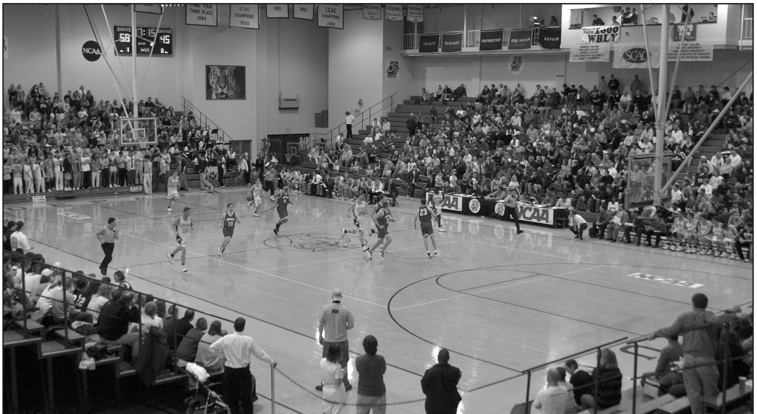
The Tigers have won over 84 percent of their games at the Neal Fieldhouse including this one in the 2002 NCAA second round against Wittenberg.